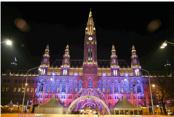
Listing #437345 15 minutes from the centre

Frohe Weihnachten , a sign in lights, situated in the Christkindlmarkt market of Rathausplatz , welcomes a Merry Christmas to the city. The streets are bathed in luxury and spectacular lights, while locals sing classical music for the New Year's Eve concert. For those travelling with kids a stop at Prater is a must, the oldest amusement park in the world (1895). The giant Wheel is a landmark in the city, and the best place to enjoy breathtaking views.