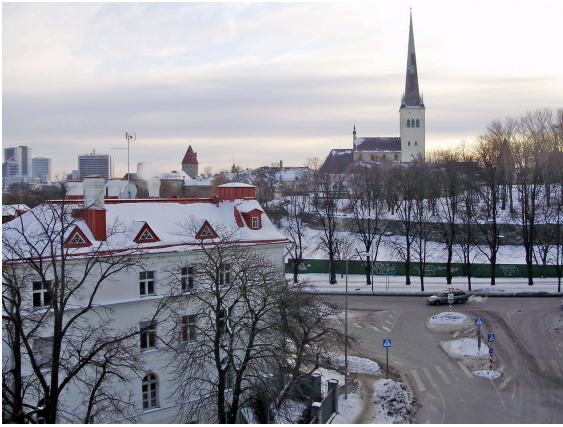
Listing #242003 New 5th floor apartment with views